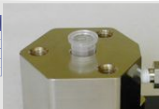
The sample tube protrudes above the base for easy and convenient placement and retrieval.

"The capillary loader is really handy. I have two in my lab, one for packing capillaries and one for loading samples in my mass spec. Packing my own capillaries saves me hundreds of dollars on each one."