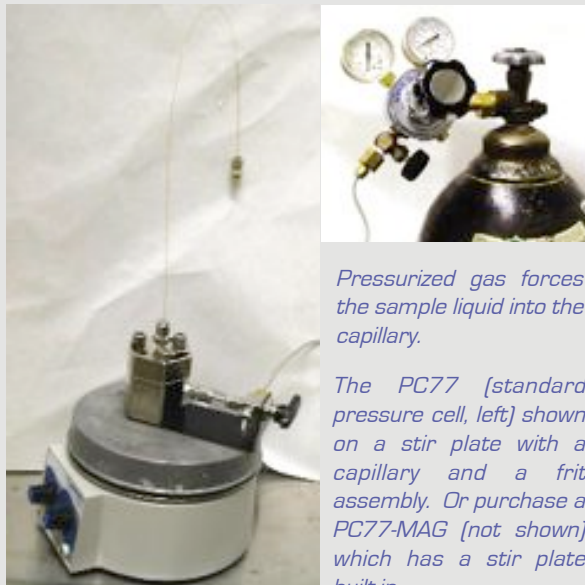
Pressurized gas forces the sample liquid into the capillary.

The PC77 (standard pressure cell, left) shown on a stir plate with a capillary and a frit assembly. Or purchase a PC77-MAG (not shown) which has a stir plate built-in.