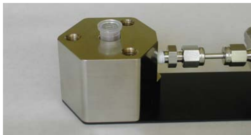
The sample tube protrudes from the base for easy insertion and removal.

Place the sample tube in the main hole of the base. The tube should not be capped. If the cap is hinged, you must cut off the hinge (with scissors). There is a recess in the top so the tube can protrude from the base, but a hinged cap will not fit in the recess.