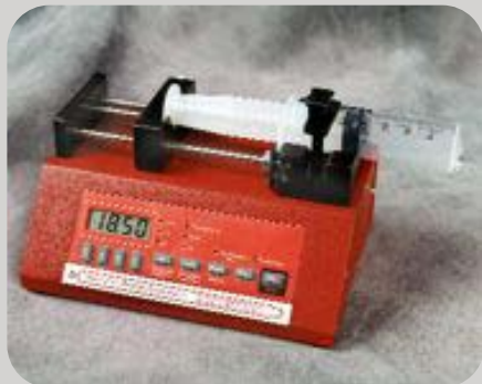
SP1000 Single Syringe Pump