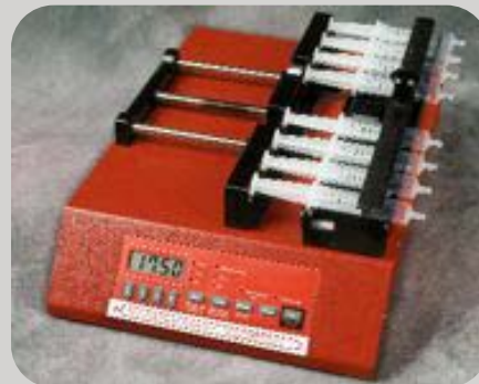
SP1800 8-Syringe Pump