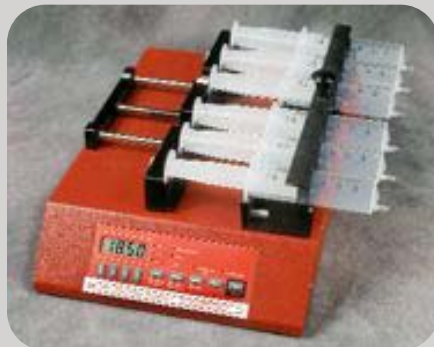
SP1600 6-Syringe Pump