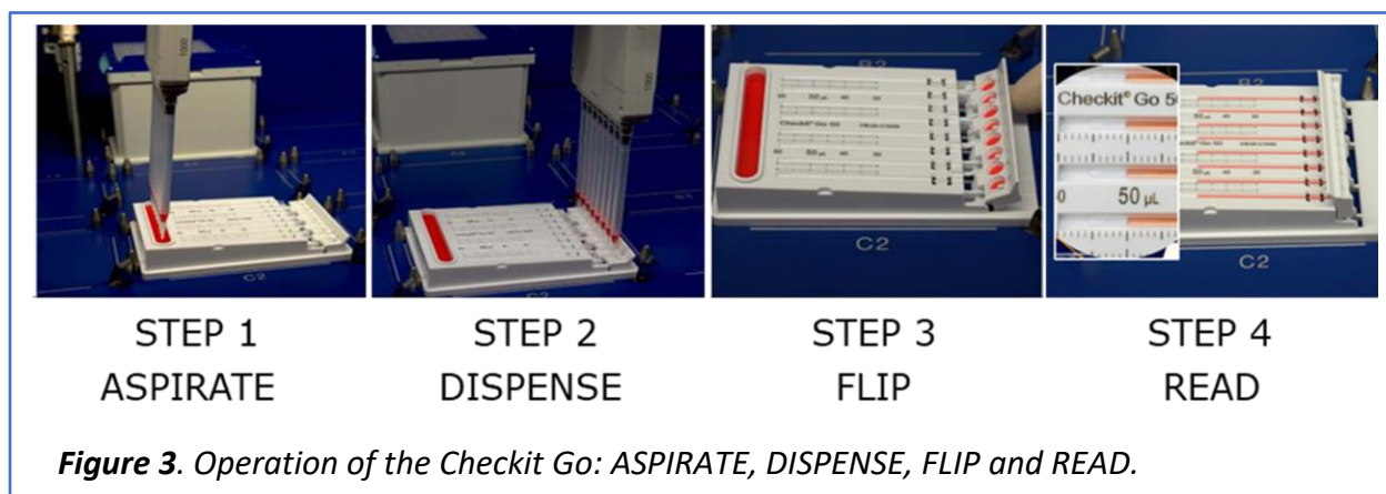
Figure 3. Operation of the Checkit Go: ASPIRATE, DISPENSE, FLIP and READ.

The operation of the Checkit Go to check the accuracy of your manual or robotic liquid handlers consists of four steps, as shown in Figure 3: (i) aspirate pipettes with your sample liquid, (ii) dispense into the wells tab, up to 8 channels simultaneously, (iii) flip the wells tab and (iv) read the volume. Checkit Go measures the accuracy of all eight channels in under 10 seconds. No special training is required.