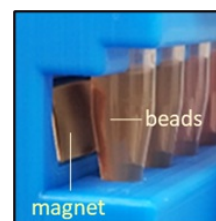
Figure 2: Magnetic beads separate to the back wall of the tubes, when placed in the magnetic rack.