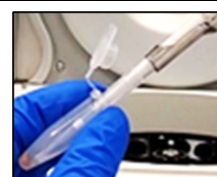
Figure 5: Using the tip of a pipette, carefully remove all of the remaining Wash Buffer that has collected just below the magnetic bead pellet.