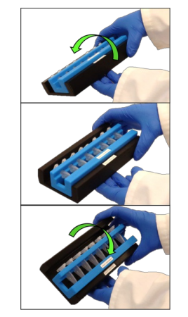
Figure 4: With the tube rack in the mixing base, gently mix the tubes top down (upper panel). Mix until the beads are completely resuspended.