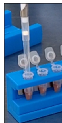
Figure 3: Using pipette tips, carefully remove the supernatant. If needed, hold the tube to prevent the tube from moving/spinning.