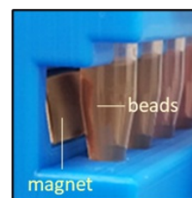
Figure 2: Magnetic beads separate to the back wall of the tubes, when placed in the magnetic rack.