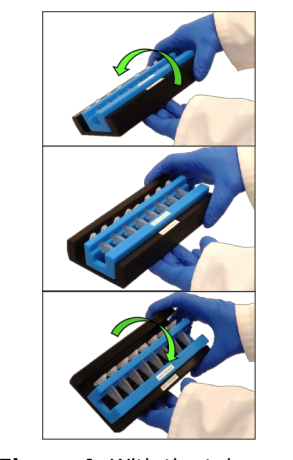
Figure 4: With the tube rack in the mixing base, gently mix the tubes top down (upper panel). Mix until the beads are completely resuspended.