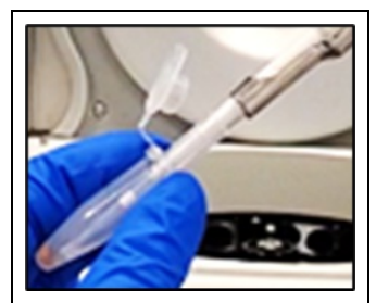
Figure 5: Using the tip of a pipette, carefully remove all of the remaining Wash Buffer that has collected just below the magnetic bead pellet.