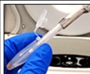
Figure 5: Using the tip of a pipette, carefully remove all of the remaining Wash Buffer that has collected just below the magnetic bead pellet.