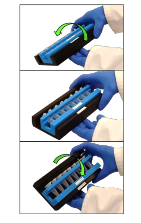
Figure 4: With the tube rack in the mixing base, gently mix the tubes top down (upper panel). Mix until the beads are completely resuspended.