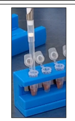
Figure 3: Using pipette tips, carefully remove the supernatant. If needed, hold the tube to prevent the tube from moving/spinning.