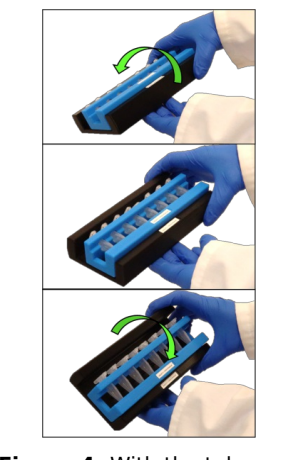
Figure 4: With the tube rack in the mixing base, gently mix the tubes top down (upper panel). Mix until the beads are completely resuspended.