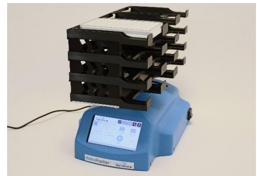
Two and four level racks are available, with capacities to securely hold 6 and 12 culture plates, respectively. These racks provide more uniform growth conditions, in contrast to stacking plates directly on top of each other, which can lead to uneven exposure and variability.